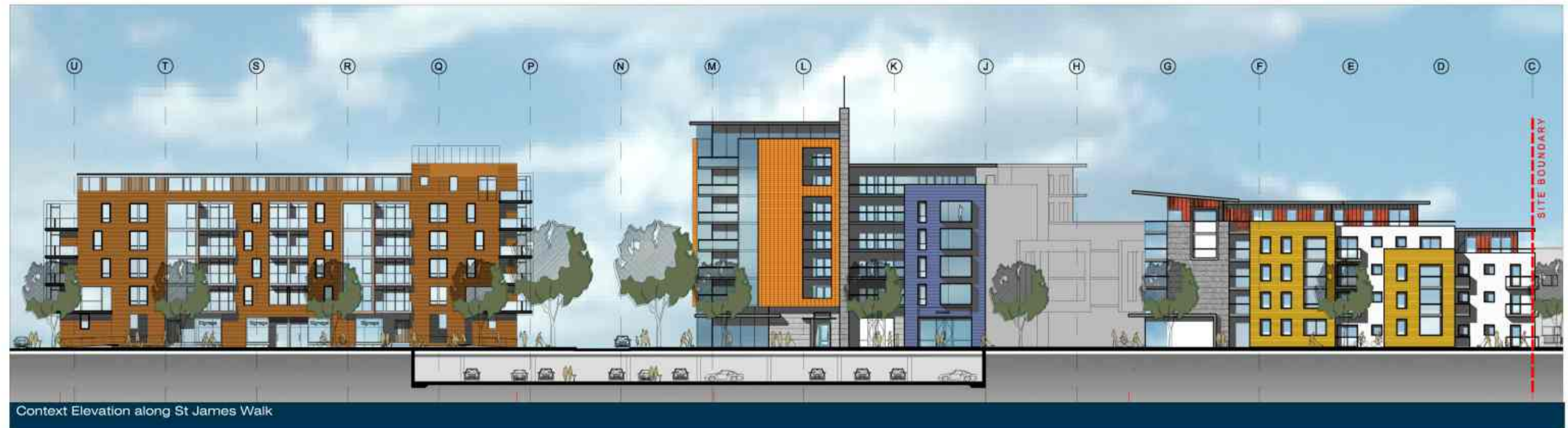
Context Elevation along St James Walk