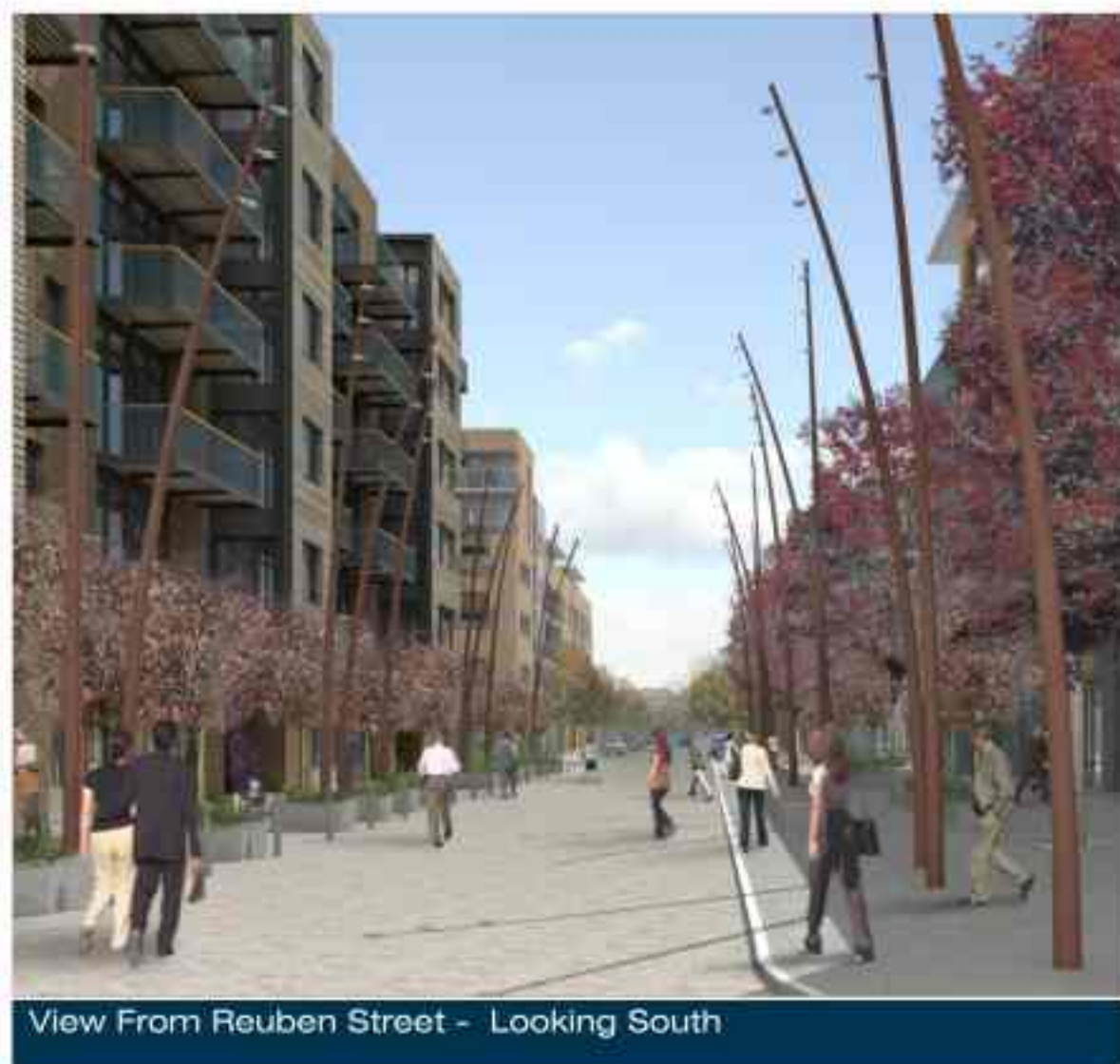
View From Reuben Street - Looking South