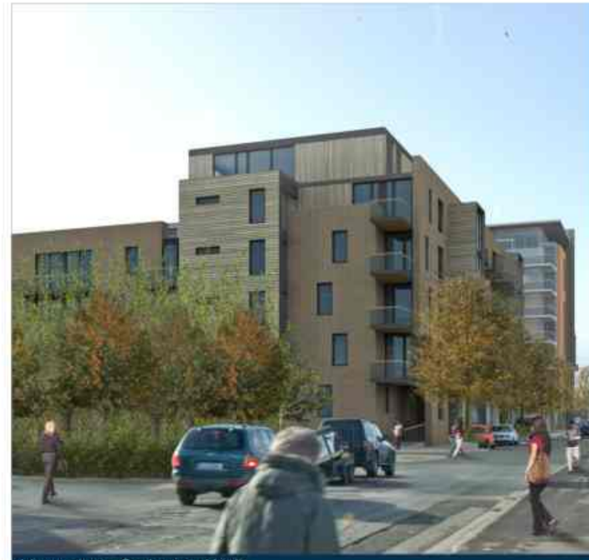
View along St James Walk