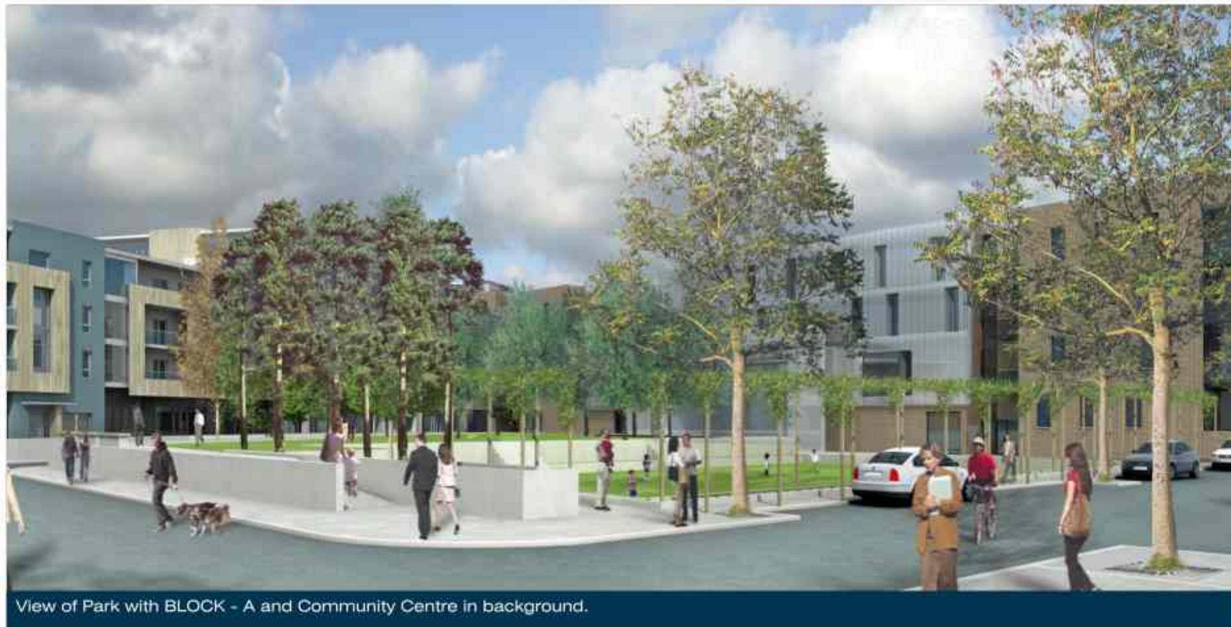
View of Park with BLOCK - A and Community Centre in background.