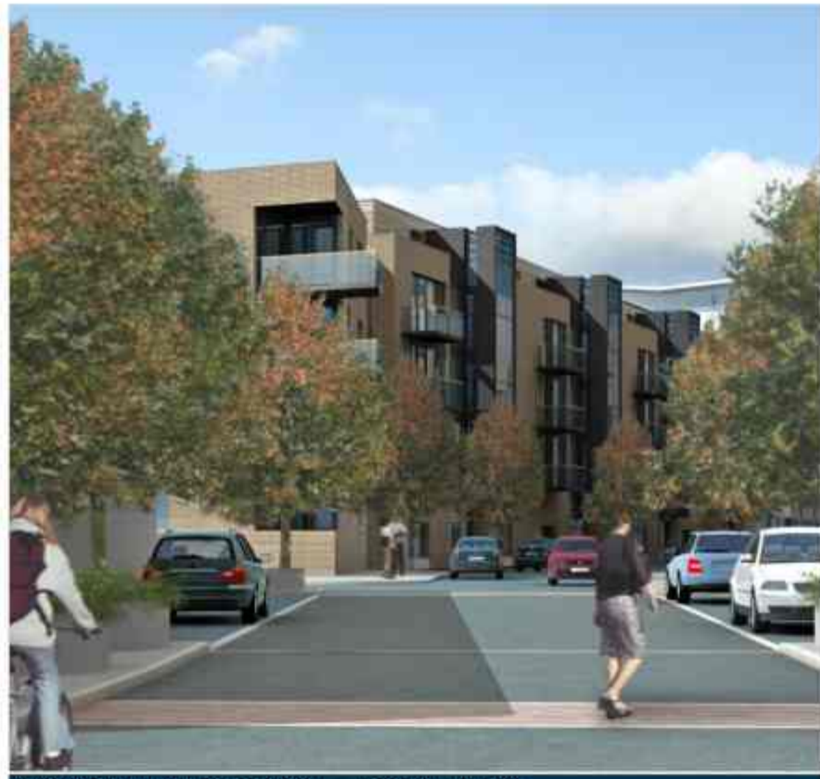
View From Reuben Street - Looking North